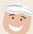
Governor of Kentucky, Steve Beshear